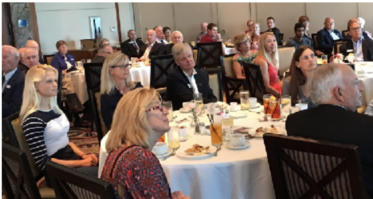
YCS April 12, 2016 - Y'20 Students and Parents