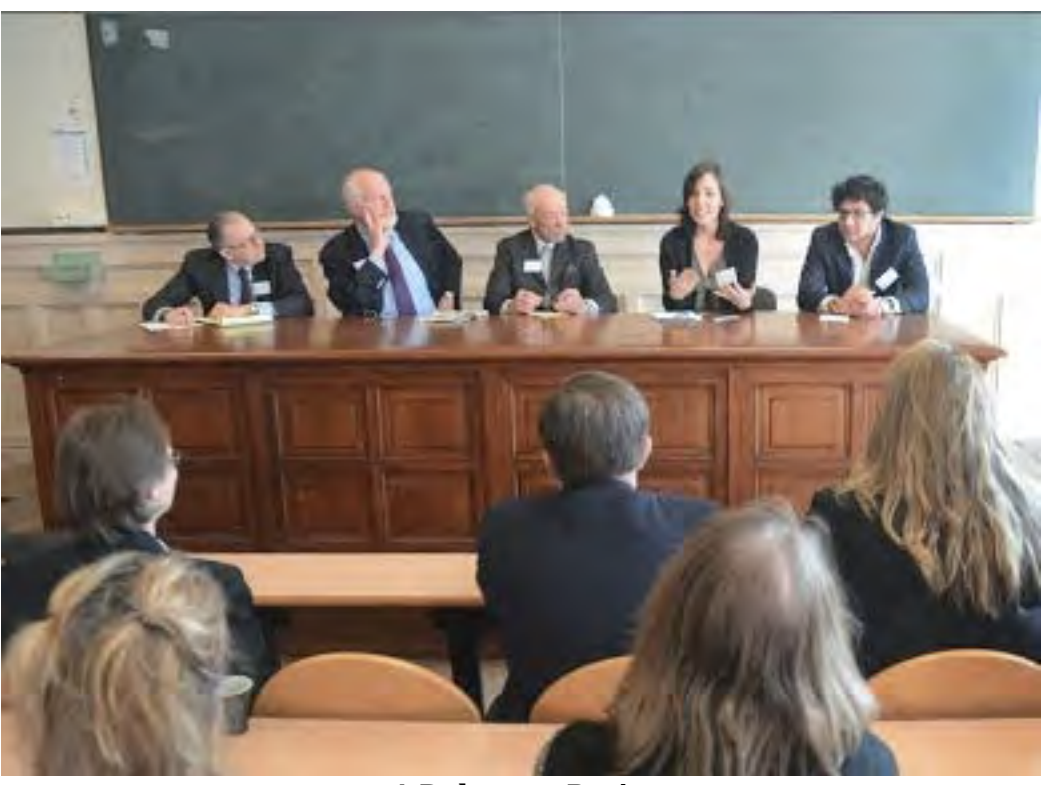
A Debate at Paris

After tours of the Musée de Cluny, Paris' Museum of the Middle Ages, with an address by the museum's director, and of the Pantheon, we ended the trip with a dinner overlooking Paris from the top of the Pompidou Centre.