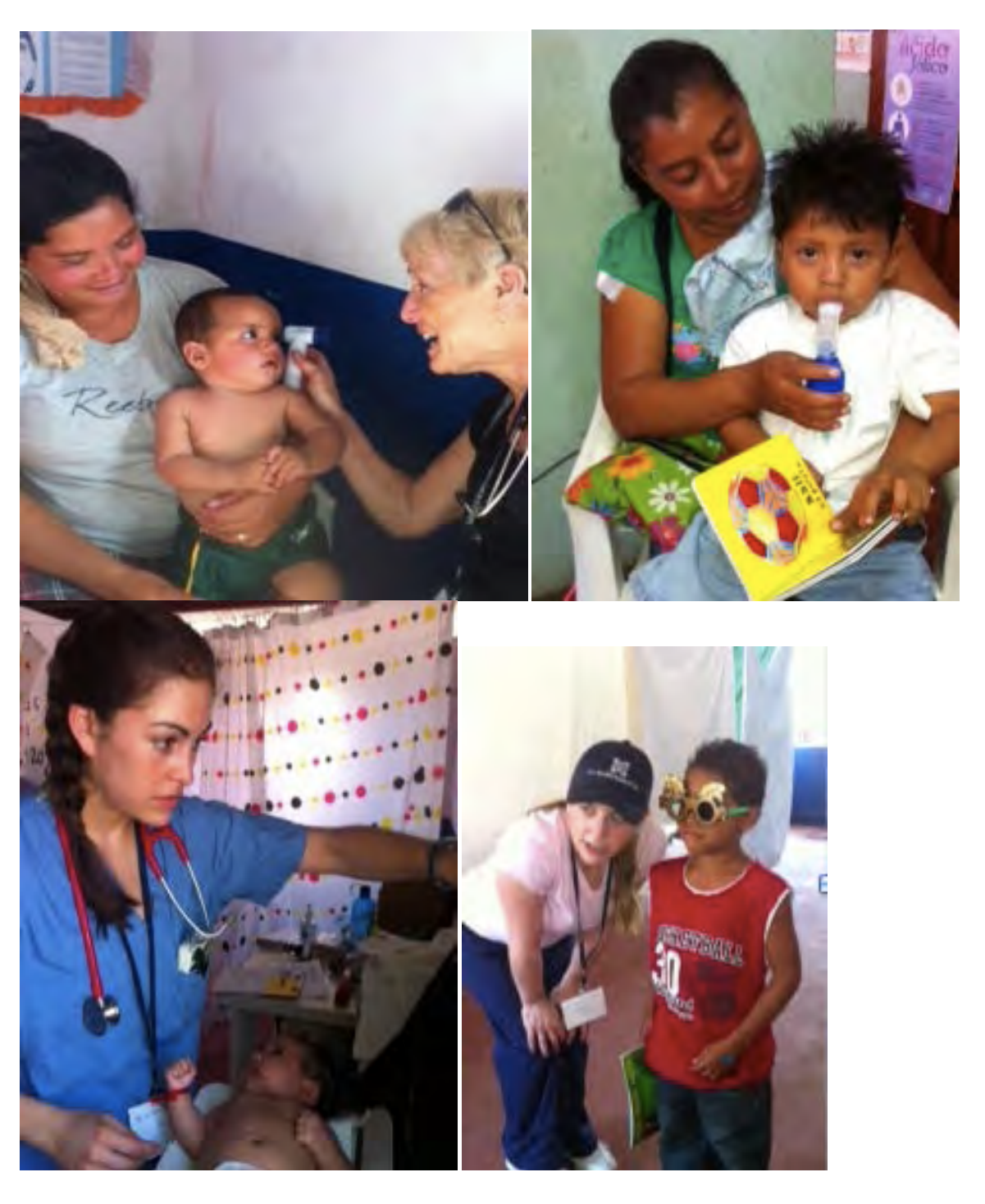
Above: Caring for an infant at Clinic, Child uses nebulizer donated to Clinic by YSN Student weighs an infant, Student checks child's vision