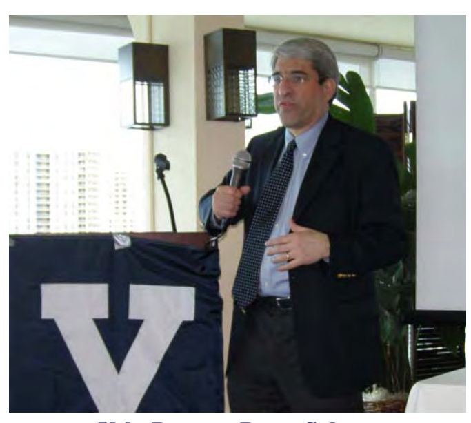
Yale Provost Peter Salovey

But now what? What plans and policies are to be kept intact and what are to be delayed or cut?