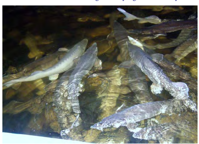
Young, but mighty, the still juvenile sturgeons begin to crowd the enormous tanks before being placed into even larger growth tanks

With cutbacks due to the current economic malaise the Mote Aquaculture staff numbers 15 while, its normal number should be significantly higher. Obviously a