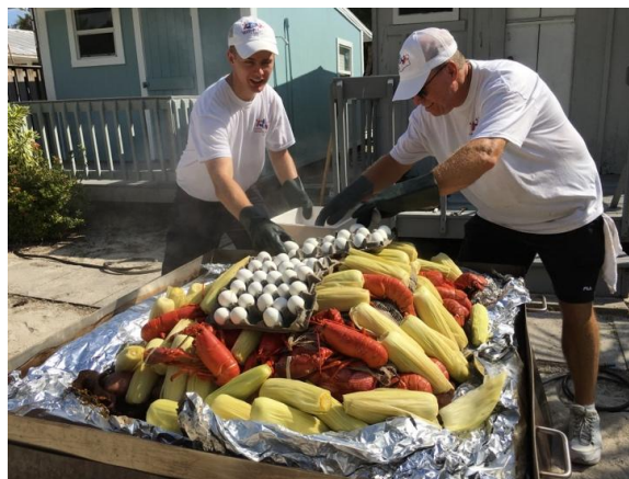
This picture shows the unveiling of his artistry: Maine lobsters, Maine steamer clams and wild mussels, corn on the cob and hard boiled eggs on a bed of New England seaweed.