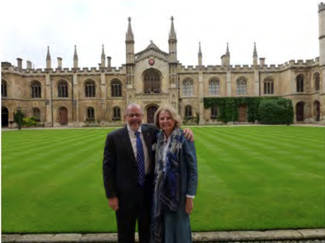
Yale Ambassadors to the UK