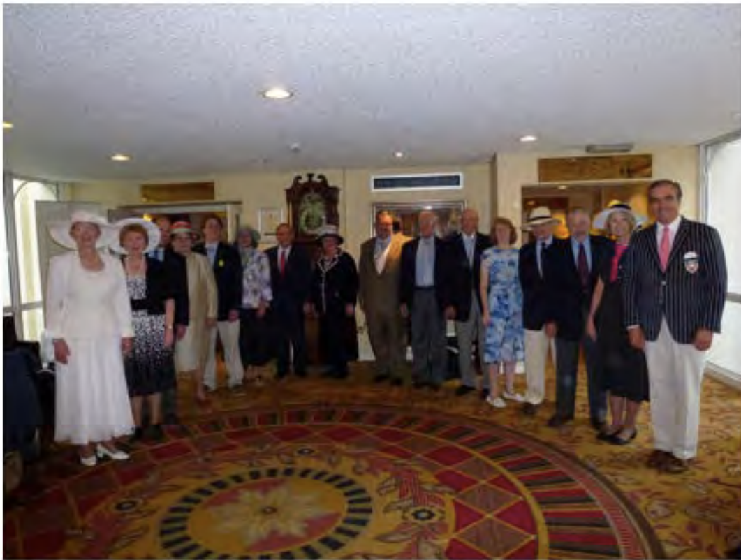
"Dressed to the Nines" at Henley Regatta