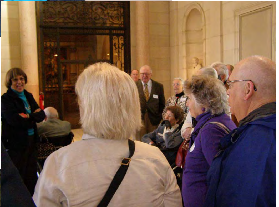
Warmly dressed Club members gathered to begin the tour of the galleries on the way to the Canaletto special exhibit.