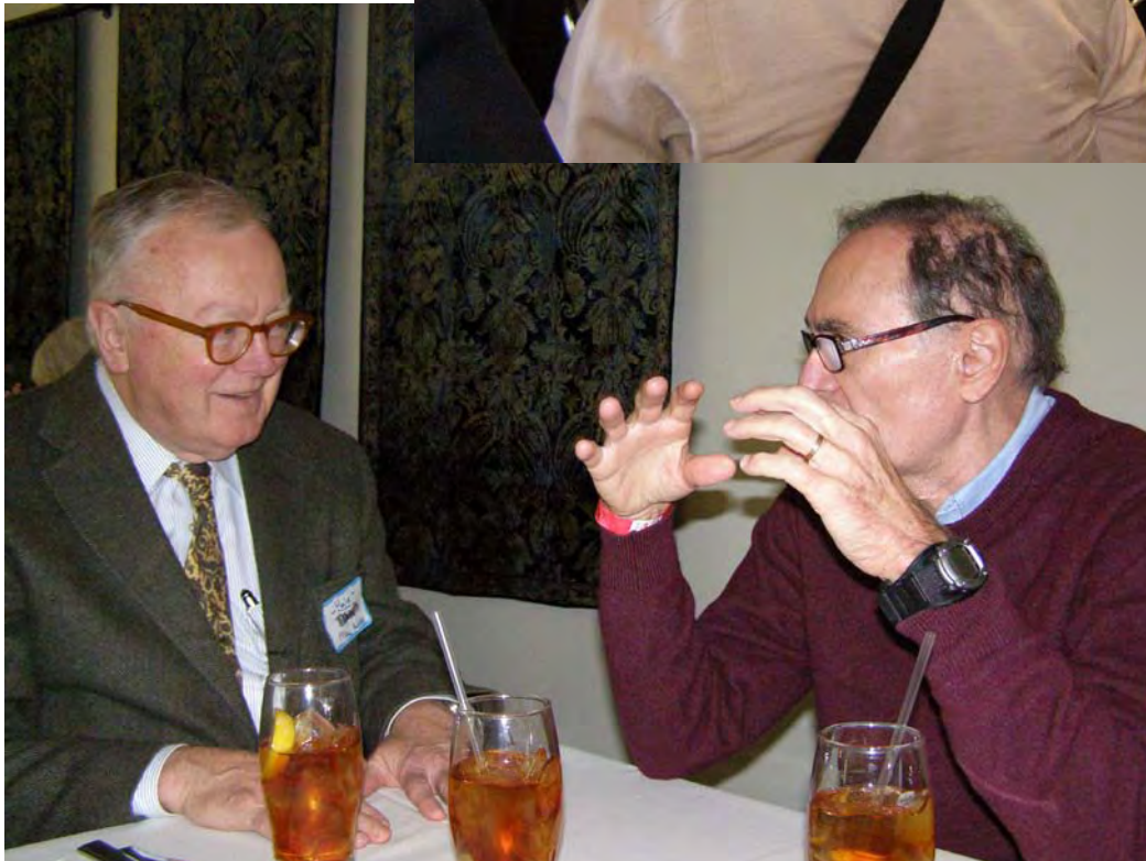
A delicious lunch in Treviso and animated discussions among contented members brought the event to an end.