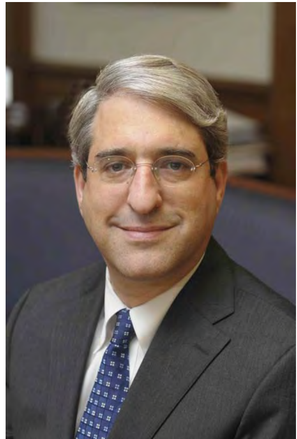
Dr. Peter Salovey

Dr. Salovey has written or edited 13 books translated into 11 languages and has published more than 350 journal articles and essays focused primarily on human emotion and health behavior. With Jonathan D. Mayer he developed “Emotional Intelligence,” the theory that, just as people have a wide range of intellectual abilities, they also have a wide range of measurable skills that profoundly affect their thinking and action. His program of research concerns (1) the psychological significance and function of human moods and emotions and (2) the application of