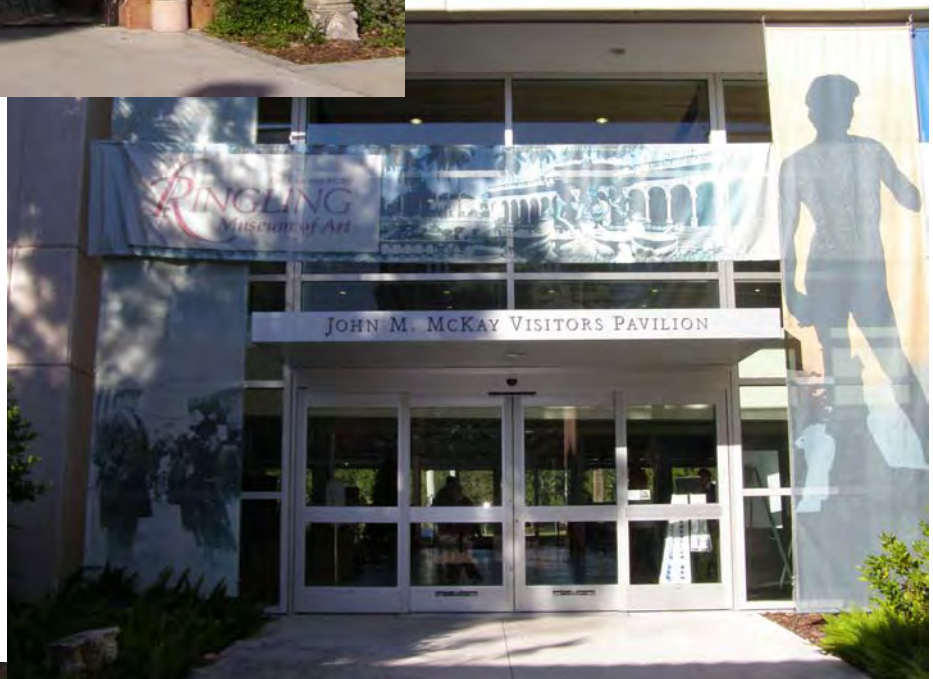
Top: Elegant gateway of the Ringling Complex.