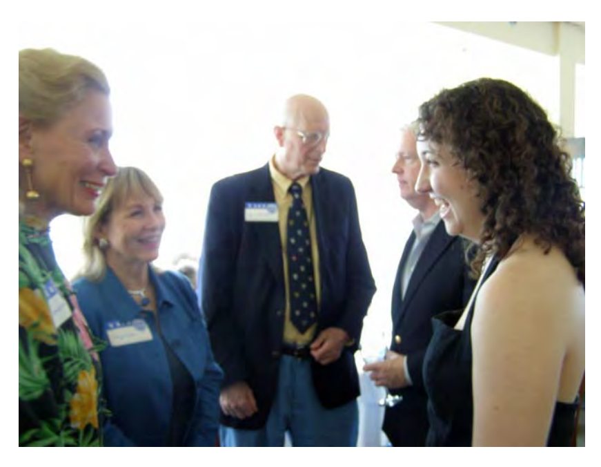
The talented young women mixed among their enthusiastic audience adding sparkle as they answered countless questions

some duets and a quartet, which added interest. Every member got a solo opportunity.