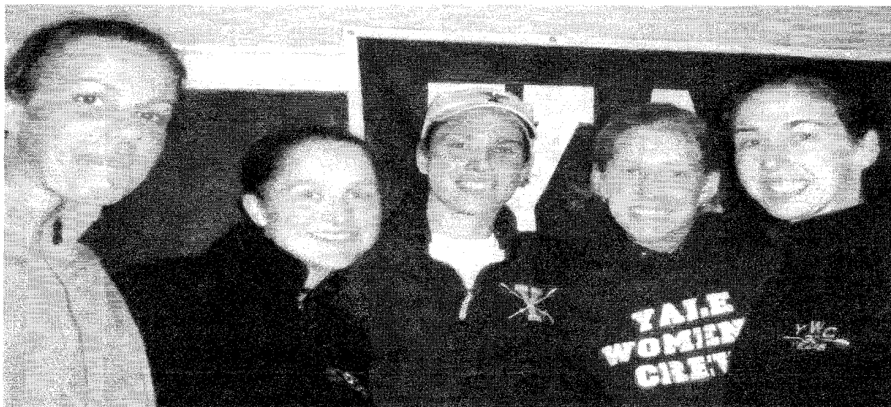
Yale Women's Crew